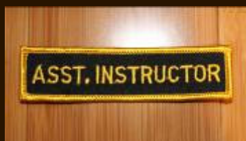
Crystal and Shaunak are ready to help!

held in January and consisted of 6 grueling days of intensive training, instruction in curriculum ranging from white through black belt, including advanced techniques.