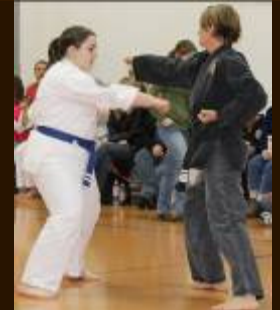
Casey defends herself from attack